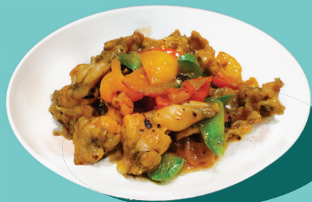
709 豉汁炒田雞腿 Frogs' legs w/ Black Bean Sauce $ 31 99