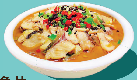
706 酸菜魚片 Sliced Fish w/ Preserved Vegetable $ 31 99