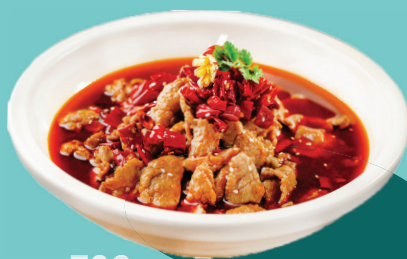
708 川辣水煮牛肉 Szechuan Poached Sliced Beef in Hot Chilli Oil $ 31 99