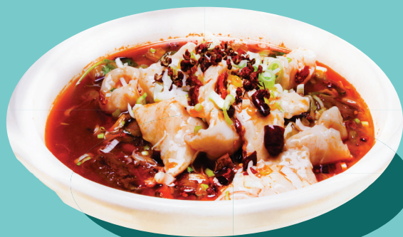
707 川辣水煮魚 Szechuan Poached Sliced Fish in Hot Chilli Oil $ 31 99