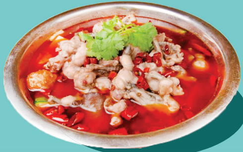
704 水煮田雞腿 Boiled Frogs' legs $ 31 99