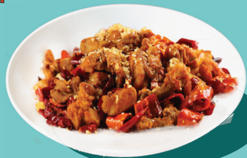
710 金牌辣子雞 Sautéed Diced Chicken w/ Chilli Pepper $ 22 99