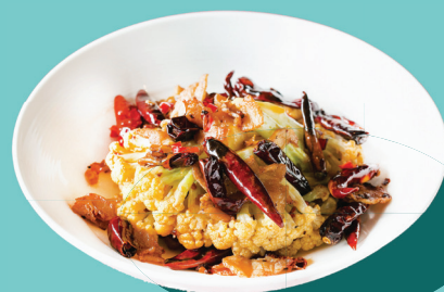
712 乾鍋辣爆菜花 Fried Cauliflower w/ in Hot Pot $ 20 99