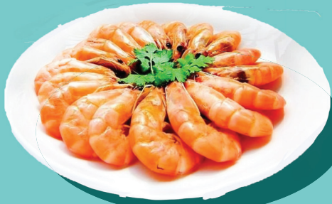
702 白灼基圍蝦 Poached Shrimps $ 22 99