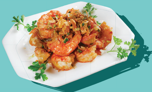
711 酥炸黃金蝦 Deep Fried Golden Prawns $ 22 99