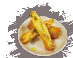
Veggie Spring Rolls