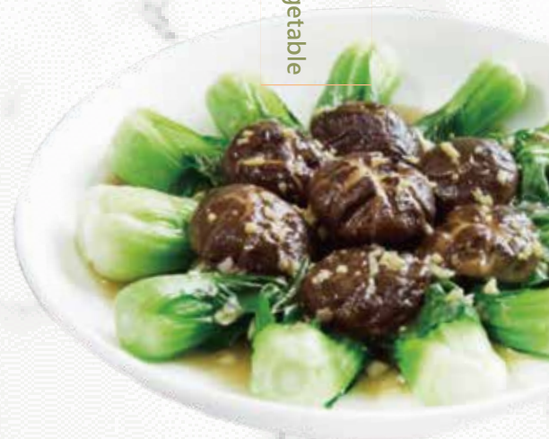
◆ 麻婆豆腐 Spicy Mapo Tofu w/ Minced Pork

圖片僅供參考，請以實物為準。如閣下有任何食物敏感或特殊要求，請提前告知侍應生。多謝合作！ ALL PICTURES ARE FOR REFERENCE ONLY AND SUBJECT TO AVAILABLE PRODUCTS. IF YOU HAVE ANY FOOD ALLERGIES AND SPECIAL REQUIREMENTS, PLEASE LET THE SERVERS KNOW. THANK YOU FOR YOUR COOPERATION. 以上價格不含GST TAX IS NOT INCLUDED