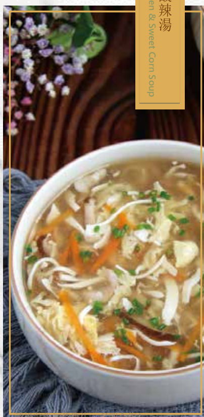
◆ 海鮮酸辣湯 Minced Chicken & Sweet Corn Soup