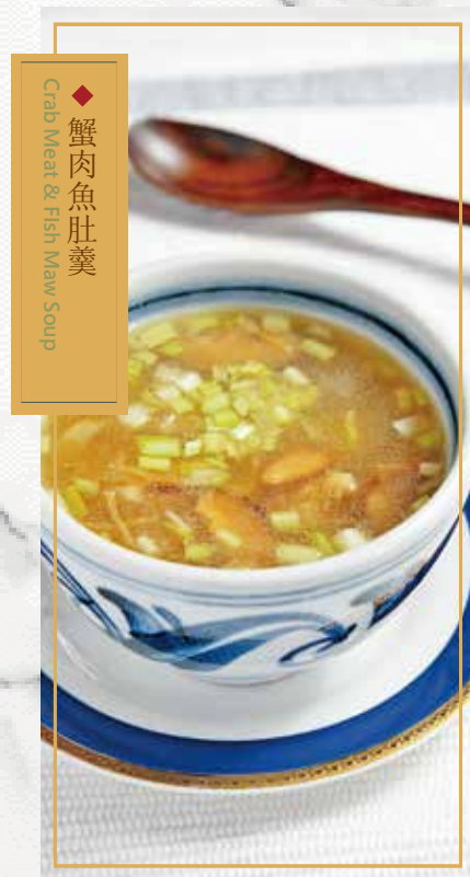
◆ 蟹肉魚肚羹 Crab Meat & Fish Maw Soup