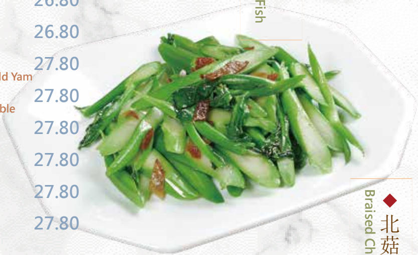
◆ 北菇扒時蔬 Braised Chinese Mushroom w/ Vegetable