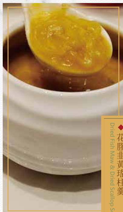
◆ 花膠韭黃瑤柱羹 Dried Fish Maw & Dried Scallop Soup