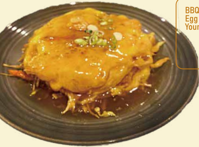
BBQ Pork Egg Foo Young

All pictures are for reference only and subject to available products. 18% gratuity on parties of 6 or more, including children. Please be advised that food prepared here may contain these ingredients: Milk, Eggs, Soy, Nut, Shellfish. If you have any food allergies and special requirements, please let the servers know. Thank you for your cooperation.