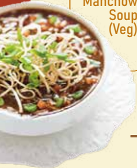
Manchow Soup (Veg)