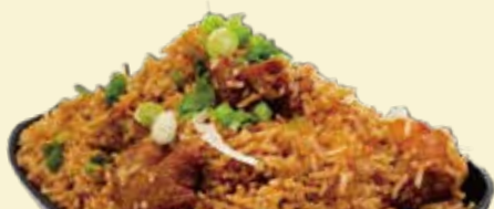
Szechuan Fried Rice